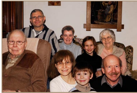
Christmas with Family