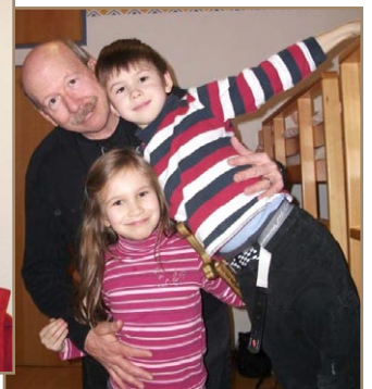
Family fun at a Youth Hostel