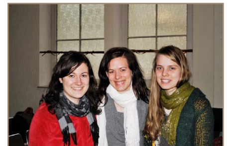
New girls wanting to help